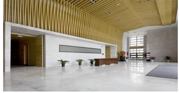
Guanghua School of Management, Peking University: neutral of ArtGo's marble and the clean space of Ivory Tower are interpenetrated with each other, create a strong artistic atmosphere.