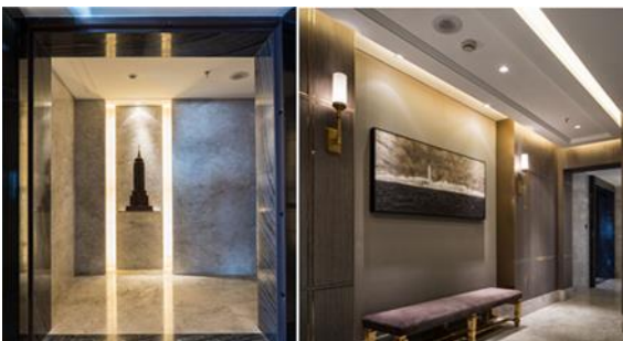
Vanke Emerald Riverside, Shanghai: used the light grey marble of Abba stuck as a whole, natural texture and small amounts of off-white create a natural and elegant space.