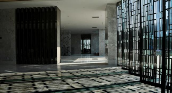
Liudong Ramada Plaza, Liuzhou: light and shadow reflected in the plain and neat marble ground, the space to add artistic conception.