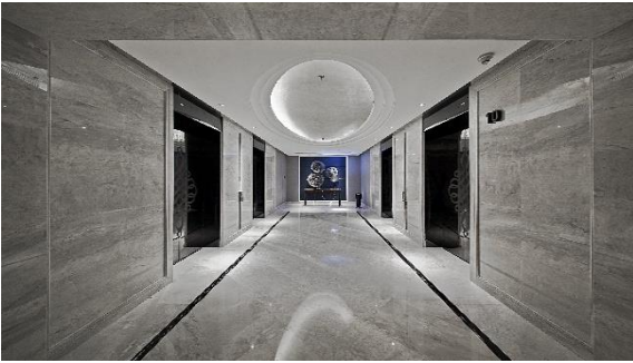
Shenzhen Yuanpeng Design Institute: ground and wall with white-gray color marble, building up the low chroma of three-dimensional space.