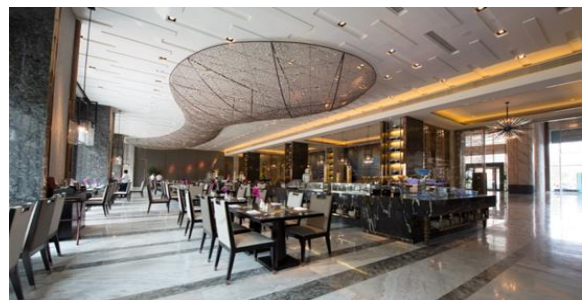
Wanda Vista Hotel, Nanning: wall and floor used "Van Gogh" product series, build a special aesthetic feeling.