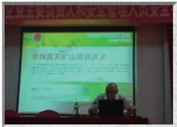
Training on environmental protection and safety in mining