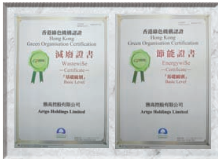
Wastewi$e Certificate and Energywi$e Certificate