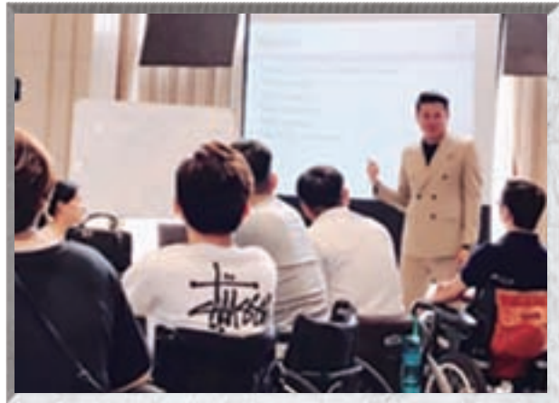
Devotion to public welfare with care for society