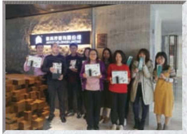
Start-up red packets and lucky draw on Lantern Festival to boost employees' cohesiveness