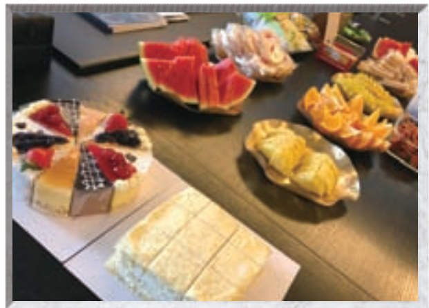
Organizing employee birthday party to enable them feel the warmth of being with the family