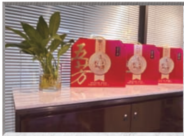
The Company offered employees gifts to express gratitude and condolences on Dragon Boat Festival and Mid-Autumn's Day