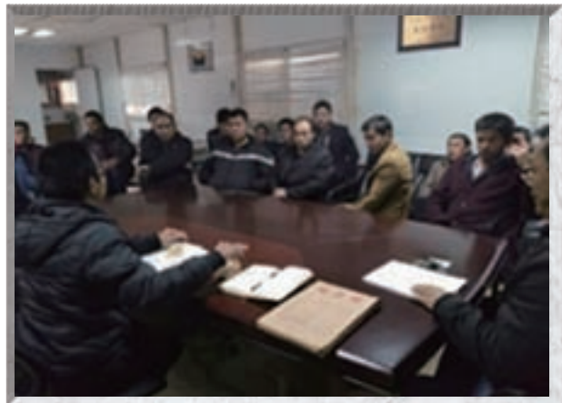
Special training on safe production for frontline workers at production bases