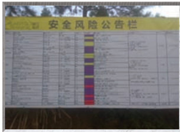
Post safety notices on the production site